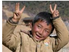
A village boy is excited to see visitors.

For the last several years, members of Gloria Dei have been called to bring Jesus Christ to the remote parts of China, specifically to the Yunnan Province and Tibet, a region known for its isolation due to the vast Himalayan mountains. Its freezing winters and dry summers make the inhabitants fight for daily survival. Its main religion is Tibetan Buddhism, which believes in reincarnation and the steps to enlightenment. A common practice of their religion is to offer gifts to statues as a payment for eternal life.