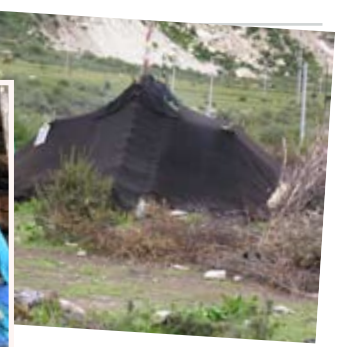
The region is known for its nomadic population who sleep in tents throughout the year and herd Yaks for milk, hair and transportation.