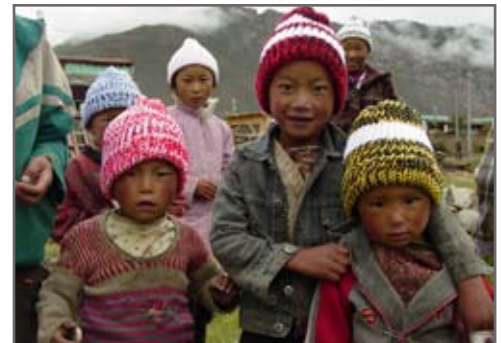
These children from a remote village in Tibet are proud recipients of hats made by members of Gloria Dei.