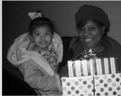
A happy mother receives her family's gifts from the giving tree.

We know that God had his hand in this project, because every time we had a need, there was someone calling ready to provide it. Seeing the faces of children light up as they wondered which gifts were theirs, watching the tears of appreciation and joy in the eyes of mothers and grandfathers, and reading thank-you cards from the