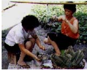
Top left: The first school in Taiwan teaches Mandarin Chinese and English as second language. Top right: Taiwan is noted for its mountains. Bottom left: Local women make rice dumplings for a festival.