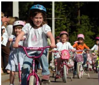
Tiny Treasures will participate in St. Jude Trike-A-Thon