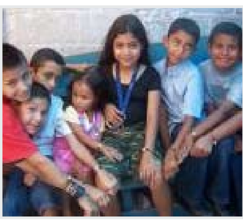
A helper combs a local girl's hair. • A group of children shows off their new bracelets.