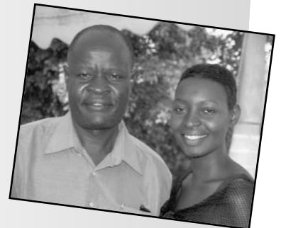
The above photos were taken by Stan Greenwood during Gloria Dei's trip to Uganda last January.