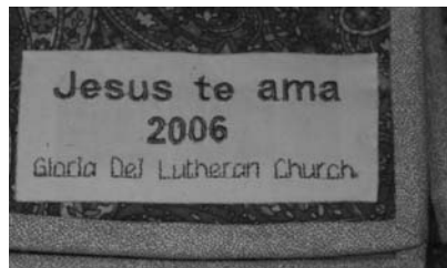
A Jesus te ama (Jesus loves you) label is sewn on each quilt.