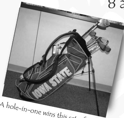
A hole-in-one wins this set of golf clubs.