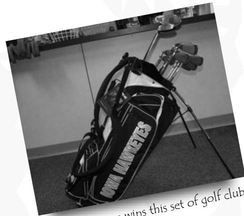
A hole-in-one wins this set of golf clubs.