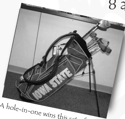
A hole-in-one wins this set of golf clubs.