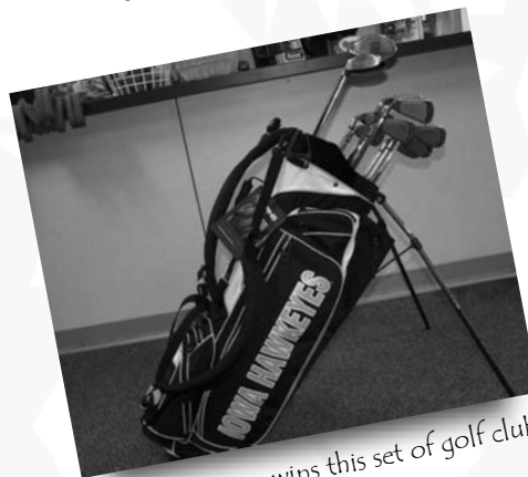
A hole-in-one wins this set of golf clubs.