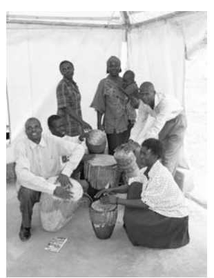
Members of the neighboring congregations practiced their instruments during the conference.

The conference was the best part of the trip. To worship, sing and praise God with the Christians in Uganda was something I will always remember.