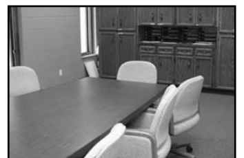
The current board room will be moved to the children's library.