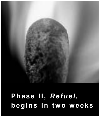
Phase II, Refuel, begins in two weeks

Phase II of Ablaze , Refueling the Fire, begins next week. We will spend four weeks looking how to keep the fire of faith burning brightly in our hearts. Often when we start living out our faith, it requires change on our part; therefore, the sermon series will concentrate on areas that may need change: